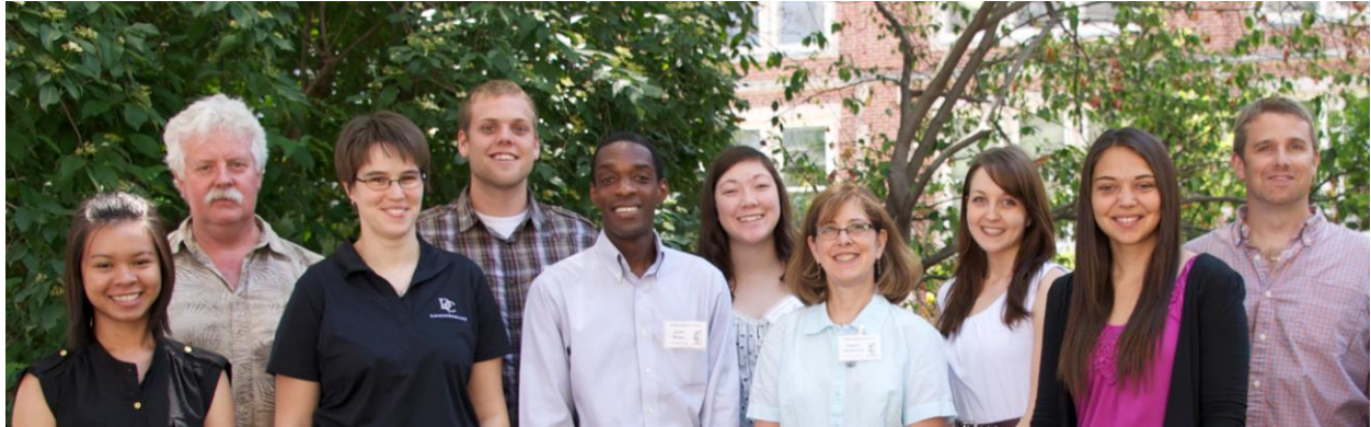
Fellows and Students from Hawkeye Community College (Waterloo), Dordt College (Sioux Center), Simpson College (Indianola), Drake University (Des Moines) and Coe College (Cedar Rapids).